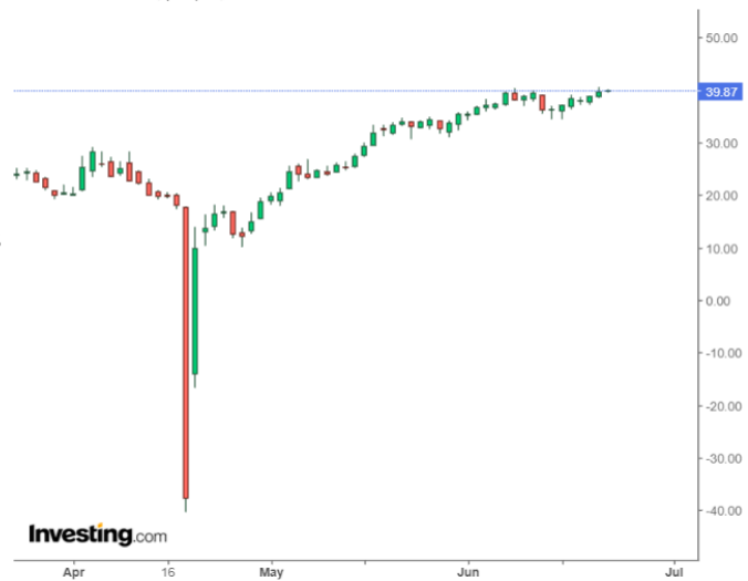
Published on Investing.com, 22/Jun/2020 - 8:42:47 GMT. Powered by TradingView. Crude Oil WTI Futures, (CFD):CL, D

White House Trade Adviser Peter Navarro said Sunday that the Trump administration was preparing for a possible second COVID-19 wave this fall. 29 states and US territories logged an increase in their seven-day average of new reported case numbers after many lifted restrictions in recent weeks.